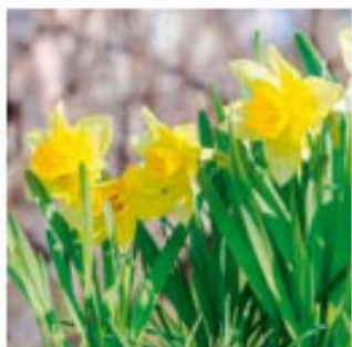
Cenhinen Bedr Daffodils