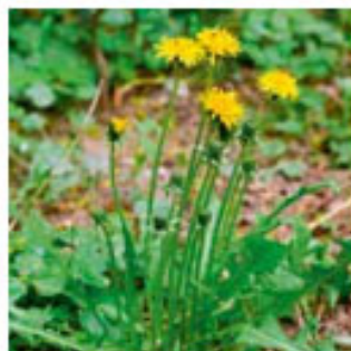
Dant y llew Dandelions