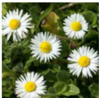
Llygad y dydd Daisies