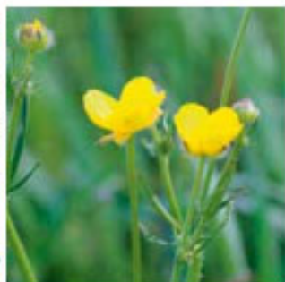
Blodyn menyn Buttercups