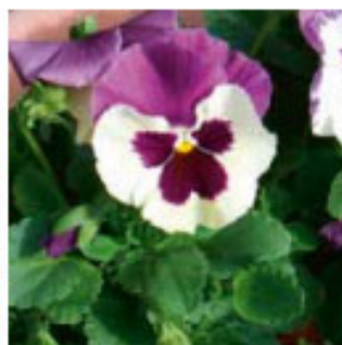
Caru'n ofer Pansy