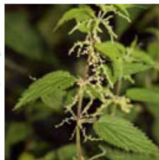
Danadl poethion Nettle